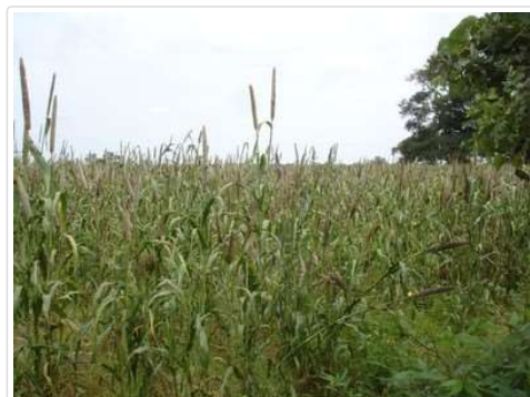
(/resources/e407ff6f-8b22-4d16-ae92-6f7f88e17f57) Fig. 1. Non-uniform field in a seed farm in Nigeria expected to be certified

This is an impossible task for one team with limited operational resources, whose members are almost beholden to their clients just to get around. Thus one has to wonder how much of this certification program is on the honor system, perhaps assisted with some nice gratuities to provide the certification (such as for the non-uniform sorghum field on a seed farm in Nigeria shown in Fig. 1). As seed certification will double the value of the crop, this also raises the question as to whether certified seed produced under these administrative and budgetary constraints is substantially better in quality than seed informally sold or distributed in village markets and by local agro-dealers, particularly to justify the nearly double price as well as the additional transportation costs. The situation results in farmers being wisely reluctant to invest in certified seed and relying almost entirely on market seed. It also means the variety identity is usually lost, although some local distinctions may be possible related to the best use, etc.