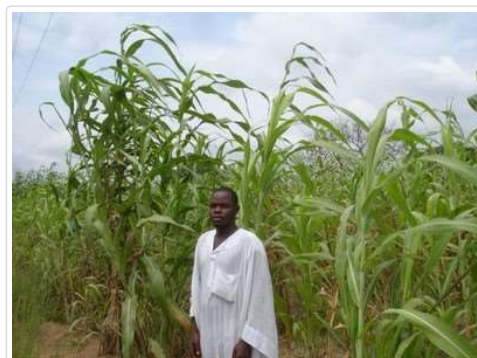
(/resources/4de82781-dbc4-47ab-87c1-7c463b5d30a8) Fig. 2. Nearly three-meter tall, less productive traditional sorghum in Nigeria compared to modern varieties typically less than two-meters tall

demonstrated, seed can easily be multiplied within a community, avoiding the need to import large volumes of nationally certified seed. Demonstrating a potential yield advantage of certified seed over market seed can be difficult, as shown in Table 1 with a comparison of yields from seed sourced by the project (institutional) vs. regular farmer-produced seed for three rice varieties in Tanzania.