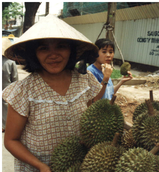
Figure 1. Crops like this durian may be seasonal and provide only part of the year.

The scale of agriculture in the tropics ranges from the small household farm to very large farms. Tropical agriculture is usually labor-intensive, seldom machinery-intensive. Large farms, sometimes called plantations, are often concerned with production of crops that can be exported. Large and medium sized farms are always concerned with sales and making a profit.