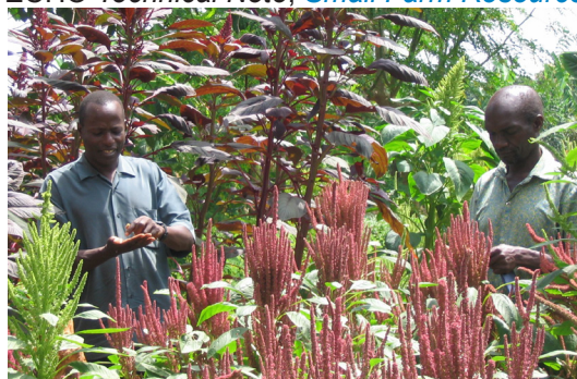
Figure 8. New crop varieties can be demonstrated to farmers in trial plantings managed by the practitioner.

Selected alternatives should be tried first in trial plantings completely managed by the practitioner – that is, you! These plantings can be set up in schools, churches, backyard gardens, rented fields, or at a small farm resource center (see the ECHO Technical Note, Small Farm Resource Development Project ).