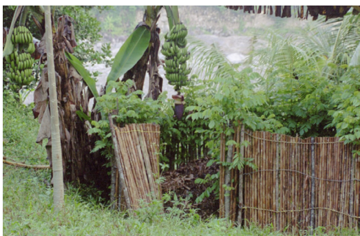
Figure 5: Composting structure - Honduras. Nearby crops take healthy advantage of the benefits.

first composted . This is feasible in the home garden, but may not be feasible on the farm. Useful results can be obtained when the organic matter is incorporated into the soil, or even when applied as a deep layer on top of the soil as mulch. For best results large amounts are needed. It is difficult to apply too much. Organic matter for composting or applying to the field can be obtained from a variety of sources. These may include hay, straw, hulls, leaves, dead weeds, market refuse and used animal bedding.