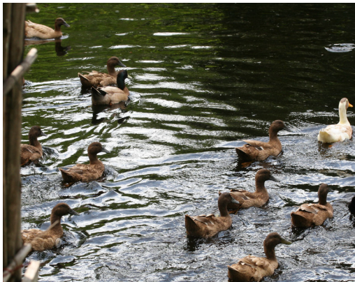
Figure 3. Integration of Ducks and Fish, utilizing the same space for both.

It is appropriate here to discuss what some consider a resource - credit. Indeed, there are many places where agriculture is deemed impossible without credit. As a general rule, the larger the farm the more easily credit can be obtained. Yet, credit implies an obligation. The farmer, small or large, assumes an obligation every time she accepts credit. The obligation is hard, absolute. Yet, her ability to pay is soft, full of risks. Small farmers are usually better off when they do not engage in the time-dishonored activity of borrowing. Without borrowing the farming risk is the same, or less, and the profit is the same or greater. You must decide whether credit is a resource or liability.