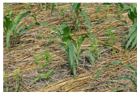
Figure 2. Common crops such as Maize and Cowpea are good ones to begin with. Here they are integrated and mulched, two useful production practices.

When starting out, experimentation with very obscure tropical plants is not advisable (See Figure 2). The properties of most plants that have a great deal of potential for the small farm are known and described somewhere (though often in publications which are difficult to get). The first place to start is always by learning from local people. Then look for plants that may be unknown in your location, but are important in other parts of the world.