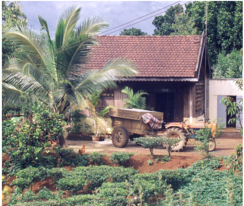
Small Farm in Viet Nam Highlands.