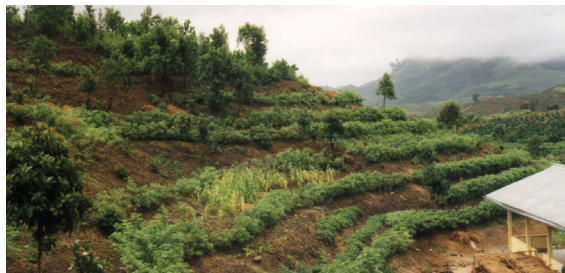
Figure 4. S.A.L.T. (Sloping Agriculture Land Technology) hedgerows help maintain soil moisture and prevent erosion.

Excess water can damage crops by flooding, excluding oxygen from the soil, loosening roots causing lodging (falling over) of plants, leaching away nutrients, eroding soil, stimulating weed growth, and basically making fieldwork difficult. The first solution to excess water is to reduce its effects by providing better systems of drainage (ditches, furrows, raised beds or planting mounds).