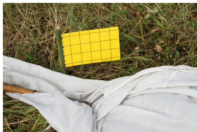
Figure 6. This yellow sticky card and insect sweep net are handy tools for IPM scouting.

Every crop plant has its pests and diseases. You should familiarize yourself with the common pests and diseases of each crop. Their control is maximized through a system called IPM or Integrated Pest Management . While the crops, their pests and diseases may be somewhat different in the tropics, the principles of control will be the same. (See the ECHO Technical Note, Control of Weeds, Insects and Diseases on the Small Farm or Home Garden . Available for free on ECHOcommunity.org )