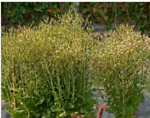
Fig. 28. Staked plants

Lettuce seed loses its viability quicker than most vegetable crops. Under ideal cool and dry conditions, seeds may maintain their viability for up to 3 years.