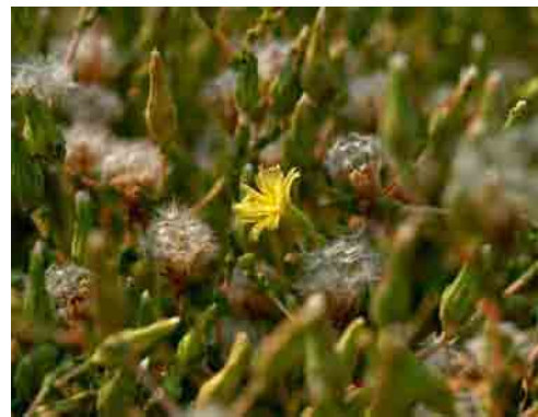
Fig. 29. Shattering seeds