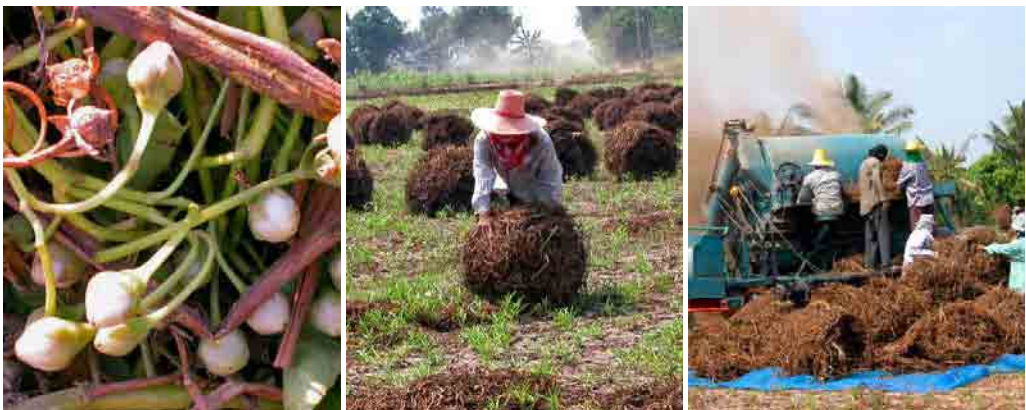
Figs. 25–27. Mature seed pods (left); rolling plants into loose bundles for drying (center); mechanical threshing of dried plants (right)

Kangkong seed will store for up to two years, a shorter time compared to most vegetable crops. Storage pests are a problem if seed moisture content is high.