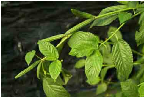
Fig. 22. Healthy and vigorous jute plant with seed capsules

Select plants that are uniform in appearance, healthy and vigorous (Fig. 22). Cover flow-