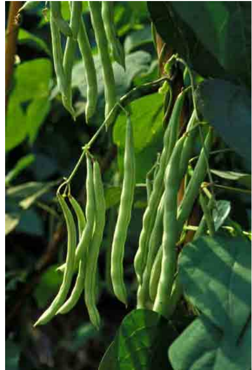
Fig. 7. Maturing bean pods

Pods are harvested when they have turned yellow but are not yet completely dry. The inner seeds will be firm, well developed, and beginning to loosen inside the pods. Harvesting is often done in the morning to avoid losses due to shattering.