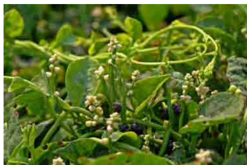
Fig. 31. Flowers and mature fruits

Harvest mature fruits with dark purple color (Fig. 31). The vines sometimes turn brown or yellow at this stage. Fruits may be harvested singly or in clusters.