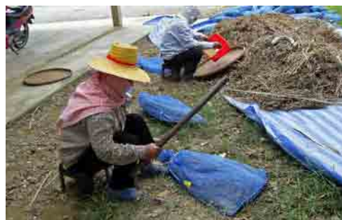
Fig. 42. Threshing pods with a stick

Soybean seed does not keep well in storage compared to the other legumes. The germination rate drops rapidly under room temperature conditions, especially in the tropics. If cool storage is unavailable, place seed in an air-tight container and add burned lime (calcium oxide) at the rate of 20–30% (w/w). Keep seed at room temperature.