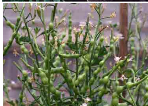
Figs. 39, 40. Radish roots (top) and ripening seed pods (bottom)