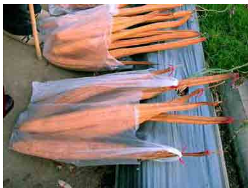
Fig. 16. Mature luffa gourd fruits

brownish color (Fig. 17). Bitter gourd fruits will turn orange. Some wax gourds will be covered with a pale-white powdery wax on the surface of the fruit. After harvest, the fruits can be kept in a shed for a couple of weeks to allow the seed to further ripen.