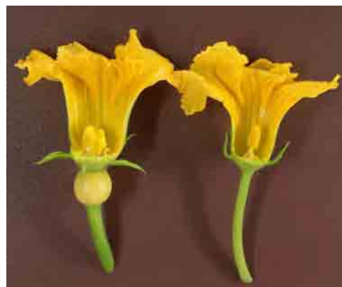
Fig. 2. Imperfect flowers of squash: female flower with exposed stigma (left) and male flower with exposed anthers (right)