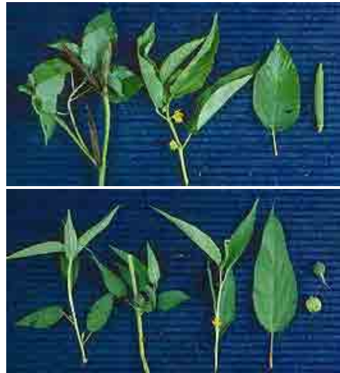
Figs. 23, 24. Popular species Corchorus olitorius (top photo) and C. capsularis (bottom photo) are closely related, differing mainly in pod shape

Among the more than 15 species of Corchorus , two are most common: C. olitorius and C. capsularis . The former produces long capsules while the latter produces round capsules (Figs. 23, 24). Both types of capsules are harvested when fully mature but before seeds begin to shatter.