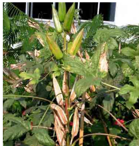
Fig. 35. Pods maturing from the base of the plant