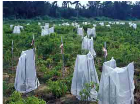
Fig. 4. Isolation of pepper selections in nylon net tunnels

After saving your seeds, it is important to keep them alive for future use. Newly harvested seeds should not be immediately stored in a plastic bag because the moisture content of the seed is still high and will lead to deterioration.