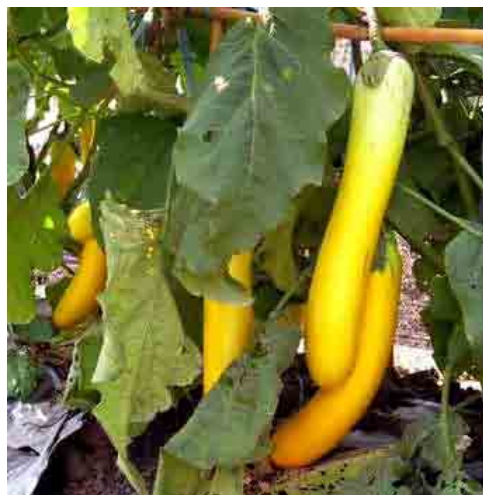
Fig. 20. Fruits at harvest

Harvesting is done when fruits are fully ripe (the skin of fruit turns brownish-yellow in green varieties or brownish in purple varieties) (Fig. 20). Harvest and store the fruits in a shed for a week until the fruits get soft.