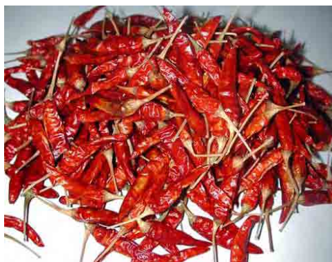
Fig. 38. Chili pepper prepared for dry seed extraction

Pepper seeds may be extracted from fresh fruits (Fig. 37) or from fruits that have been dried in the sun for a few days (Fig. 38). Seeds may be removed by hand or extracted by grinding the fruits and separating the seeds from fruits with a series of water rinses. Spread the seeds on a screen for drying under shade for 2–3 days but bring them inside every evening.