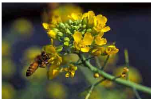
Fig. 9. Honeybee pollinating brassica flower

Special techniques may be used to facilitate the emergence of seed stalks. For cabbage, an “X” crosscut is made at the top