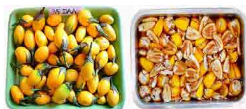
Fig. 21. Mature eggplant cut into small pieces for fermentation and seed extraction

The outer covering is peeled off and the flesh with the seeds is cut into thin slices (Fig. 21). These are then softened by soaking until the seeds are separated from the pulp. If the material is allowed to stand overnight in this condition, the separation of seeds from the pulp becomes easier. After separation, the seeds are dipped into water. The plump seeds will sink to the bottom. The seeds should then be dried on a mesh for a couple of weeks in a cool, dry place before storage.