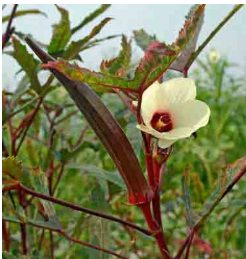
Fig. 34. Okra pod and flower

Plants for seed multiplication can be selected