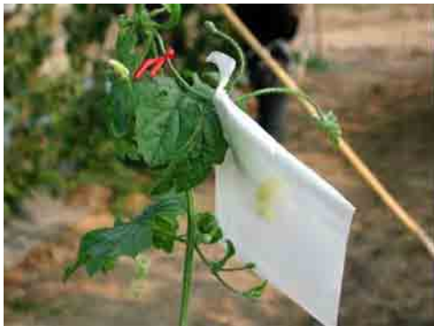
Fig. 3. Bagging bitter melon flower for hand pollination

Isolation in distance. Pure seeds can be produced by leaving enough distance between two or more varieties to prevent cross-pollination by insect or wind-blown pollen. How far apart differs among vegetables; this will be described for each vegetable in the following chapters.