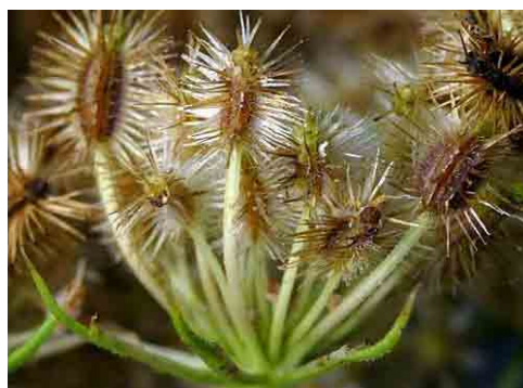
Fig. 11. Cluster of mature seeds

Allow seed to mature in a cool, dry location for an additional 2–3 weeks. Seeds can be removed by hand-beating or rubbing umbels between hands. Winnow to clean. Remove spines from dry seed by rubbing.