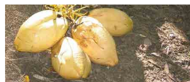
Banana, Coconut & Breadfruit