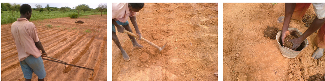
Figure 3. Photos showing the marking of lines on the ground to indicate rows of zai pits (left), pits being dug (middle), and manure being placed into the pits (right).

The zai pits are dug during the dry season when labor constraints are minimal (Fig. 3). Each pit is 20-30 cm wide, 10-20 cm deep, with the soil from the pit thrown downhill to form a crescent-shaped dam. The spacing of pits within a row, as well as the space between rows of pits, varies between 60 and 100 cm. At the beginning of the rains, 200-600 g of dung or compost (two handfuls of organic matter are approximately 300 g) are added to the pits (Roose et al. 1993). Cow dung is collected from areas where cattle graze or gather (e.g., around water holes). Other organic materials added to the pits include straw residues of crops such as millet, sorghum or maize. The organic matter is mixed, in the bottom of the hole, with approximately 5 cm soil (Sawadogo, personal communication). Each pit is then sown with 8-12 millet or sorghum seeds.