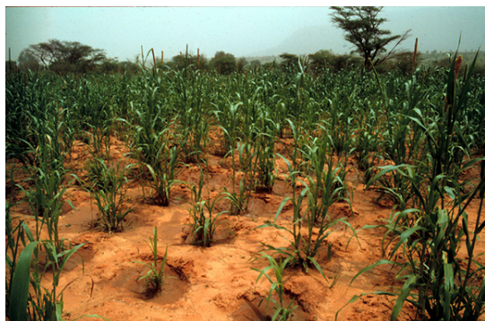
Figure 1. Millet growing in zai pits in Burkina Faso.

more difficult due to increased pressure on the land to produce crops. Consequently, innovation is critical to survival in many parts of Sub-Saharan Africa where traditional methods, such as that of long fallow periods, are no longer adequate or feasible.