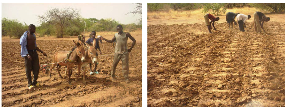
Figure 7. Donkeys used as draft power to mechanize the digging of zai pits. Intersecting plow lines mark and form planting pits.

On hard, encrusted soils, digging zai pits may be easier than tilling an entire field. Nevertheless, considering the labor-intensive task of digging the pits, smallholder farmers could benefit significantly from any practice or technique that makes it easier and faster to dig the pits. Dr. Sawadogo, at ECHO's 2011 Annual Agriculture Conference, presented a novel approach of using animal draft power to dig perpendicular plow lines in the field (Fig 7). We at ECHO would welcome any other suggestions on how to minimize the labor requirement of the zai system.