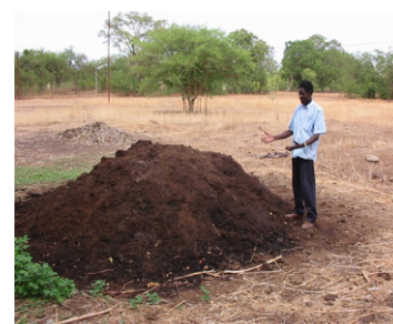
Figure 4. Compost pile for use in zai pits.

Organic inputs must be gathered. It takes at least 4 tonnes (and up to 18 tonnes/ha depending on factors such as spacing and size of the holes) of manure to amend 1 ha of zai (INADES, 1993; Kaboré et al., 1994; Sawadogo, 1996). If composting (Fig 4) is done, the gathering of this material needs to be done several months before field preparation.