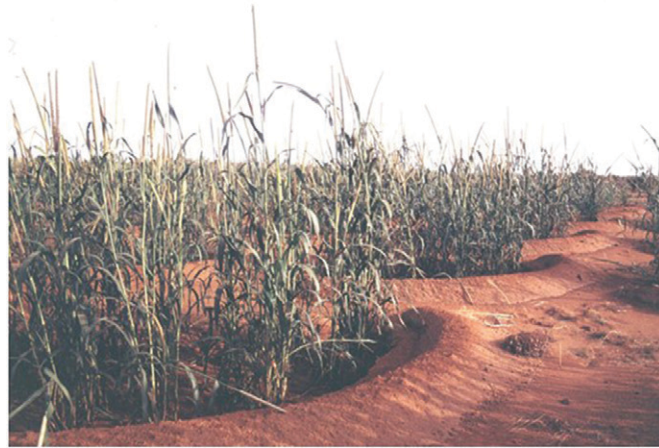
Figure 8. Millet growing in half-moon basins.

Half-moon and V-shape microcatchments are similar but with differing shapes. They are used mostly in West Africa. As with the Nagarim system, they are often used for growing trees (or a combination of trees with crops). They can also be used for growing cereal crops (Fig 8). Half-moon basins are dug to form a half-circle that is about 4 m wide with 6.3 m 2 of cultivated area (Zougmore et al., 2003). The distance between each half-moon basin, within a row of basins (following the contour), is 2 m. Half-moons are used on up to 30,000 ha of land in northwestern Burkina Faso (Sawadogo 2011).