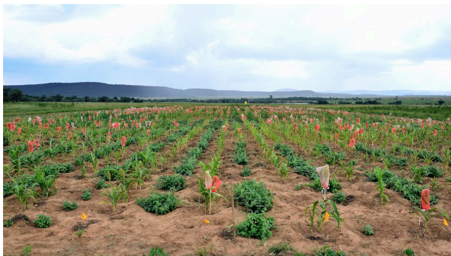
Figure 6. An ECHO zai experiment in South Africa with sorghum and legume plants grown in alternating rows of zai pits.

dense canopy by the onset of the dry season and producing a late-season bean harvest. Legume vines can also be a source of animal fodder, although their complete removal from the field reduces their soil improvement potential.