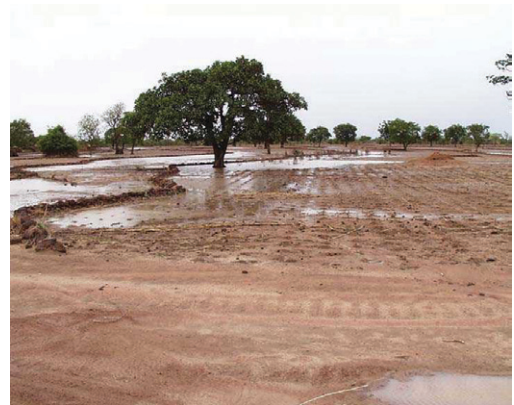
Figure 5. Zai pits in combination with stone bunds.

Split applications of amendments can extend the time over which nutrients are made available to the crop. Split applications of fertility inputs involve the initial fertilizer application, prior to planting, followed by one or more applications later in the season. Fatondji et al. (2006) reported that the zai technique did not always improve millet yields beyond those obtained with surface-applied organic inputs. This was attributed, at least in part, to the loss of nutrients due to leaching, as influenced by the timing of organic amendment application. They observed that nutrient release to crop plants, for the most part, followed the rate of decomposition of the organic materials. With enhanced water-retention in the zai pits, much of the organic matter decomposition—and subsequent nutrient release—occurred while the crop plants were still quite young and, therefore, unable to completely utilize the added nutrients before some of them (e.g., nitrogen) were leached below the root zone. In one location, manure decomposed twice as quickly as millet stalks. Based on their findings, they suggested that farmers consider split applications of organic amendments.