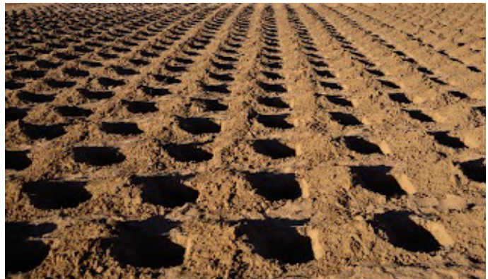
Zai pit