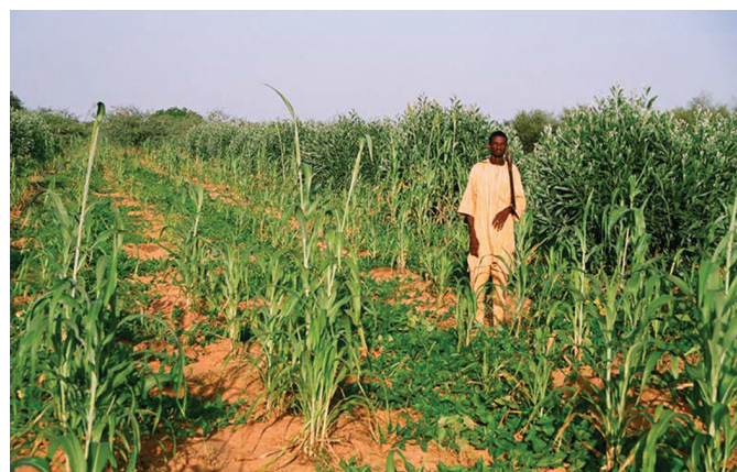
Figure 3. A typical FMAFS showing multi-purpose acacias and annual crops.

The FMAFS retains and promotes all the benefits of FMNR: biodiversity is enhanced; a diversity of trees produces firewood, timber, fodder for animals, human food, and medicines while restoring the land through protecting soils from erosion and improving fertility. The Australian acacias are extremely fast growing, fix nitrogen and provide firewood, timber, mulch and nutritious food (21% protein, 50% carbohydrate, 7% fat, with vitamins) for humans and animals, while contributing to environmental restoration and crop protection. The annual crops provide food and income as well as crop residues for animal fodder and CRM. Farmers have the flexibility to spread compost, animal manure, other organic residues or micro-dose mineral fertilizers to their annual cropping areas. Farm labor and income are spread throughout the year which gives resilience to families and helps to buffer against crop loss due to drought or insect attack.