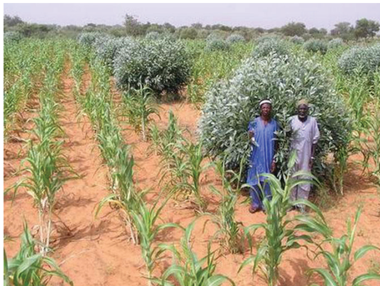
A typical FMAFS in Niger

Farming communities in the semi-arid tropical regions of Africa are becoming particularly vulnerable and face enormous challenges for their survival. Climate change, diminishing and unreliable rainfall, traditional mono culture cropping farming practices, high population growth, frequent famines and high de-forestation rates have led to severe environmental degradation and impoverished soils. This has resulted in poor crop yields, high malnutrition rates and extreme poverty.