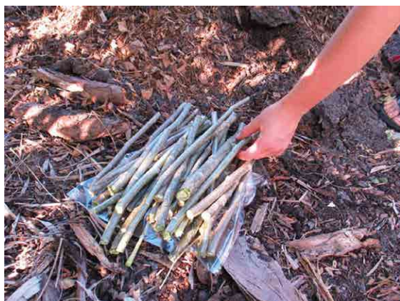
Figure 1: Chaya cuttings.

Since seeds are rarely produced, chaya is propagated from cuttings (Figure 1). Large, somewhat woody cuttings of 15 to 60 cm (6 to 24 in) are cut and planted upright or angled in moist but not waterlogged soil. Cuttings can often survive over a month without planting, but rot quickly if they become damp. It is advisable to water new chaya cuttings infrequently until they are well rooted. Once established, chaya is insect and disease resistant, and grows vigorously with little attention. The quantity and quality of foliage for use as vegetable can be increased with heavy fertilization, regular watering and pruning.