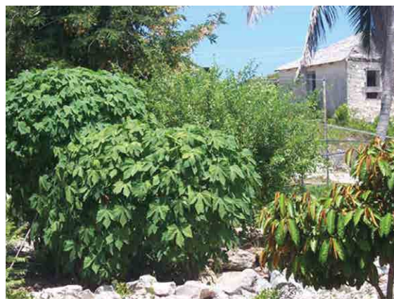
Figure 3: Chaya growing on Cat Island in the Bahamas. Note the arid, rocky terrain.

Andy Bell wrote, “In 1998(?) I requested chaya sticks to be mailed to Indonesia. They arrived wrapped in paper and still moist. I planted the sticks directly in our yard in West Java. Two of the sticks slowly began to bud and put out leaves. One of the plants was in the front of the house, one in the back. The one in the back that received fuller sun grew tremendously. Over the five years of its life, it would reach heights of three meters with over 30 productive stems and branches. While we did have some curling at times, particularly on new leaves, it never suffered from any ill health that I could observe. About two times each year I trimmed it back, almost to the ground, simply because it had grown so big. In the end, the trunk had reached the diameter equivalent to a coffee can. The one in the front had fewer leaves, I believe because it received extra shade.