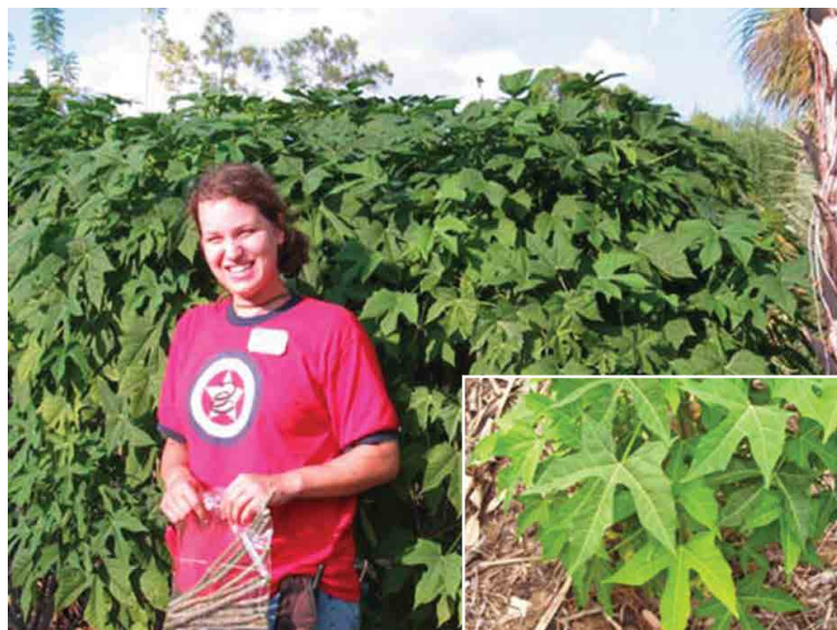
Chaya plant and close-up of leaves