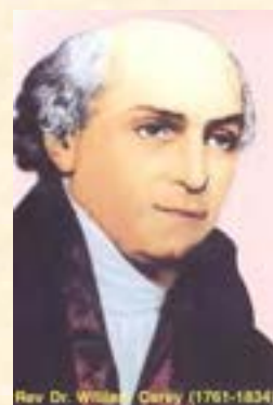
Rev. Dr. William Carey (1761-1834)