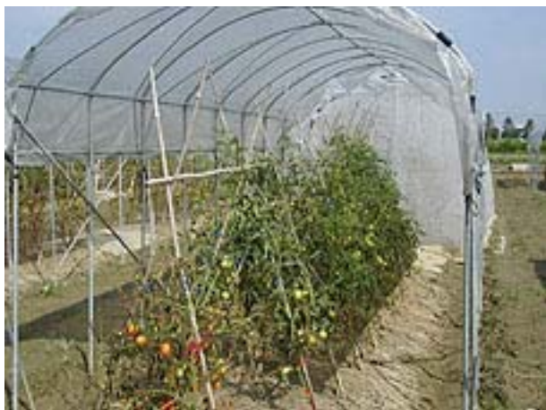
Fig. 6. Tomato crop grown under shelter.

Since grafted plants are recommended only during the hot-wet season, raised beds are highly recommended to minimize flooding. Clear polyethylene-covered rain shelters can be used to shield plants from direct impact of heavy rainfall and provide some shading (Fig. 6). Rain shelters have been shown to increase summer yields when used in combination with grafted plants.