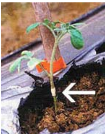
Fig. 7. Transplant set with graft union above soil.

The graft union must be kept above the soil line (Fig. 7). The closer the graft union is to the soil line, the more likely adventitious roots from the scion will develop and grow into the soil. If this occurs, disease can bypass the resistant rootstock and may lead to infection and death of the entire plant.