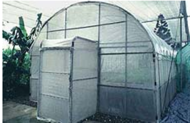
Fig. 2. Photo of screenhouse

The upper half of the structure should be covered with a separate layer of transparent, UV-resistant polyethylene to prevent rain penetration. A 50% shade net should be placed about 30 cm above the highest point of the house to reduce light intensity and temperature. Additional shading inside the screenhouse may be needed for plants during the first two or three days after being returned from the grafting chamber for hardening. A screened ventilation ridge along the top of the house is recommended for houses 6 m or more in width. This vent reduces the heat that accumulates in large screenhouses.