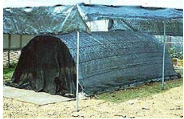
Fig. 4. Photo of grafting chamber

The use of this tunnel as a grafting chamber is illustrated on page 5 of this guide. The 2.5 x 4.0 m tunnel chamber shown below will accommodate 30 trays (40 x 60 cm), each holding 40 plants using 6.0-cm-diameter pots. Thus, the tunnel chamber capacity is 1,200 seedlings.