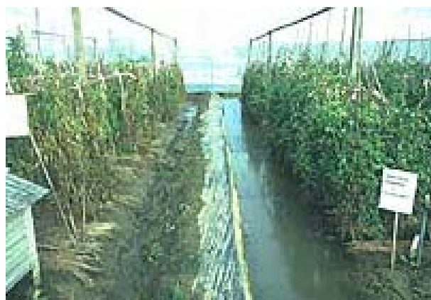
Fig. 1. Tomato plants stressed by flooding during the rainy season. Grafted plants (right row) are vigorously growing while non-grafted plants (left row) are dead.

Most eggplant lines will graft successfully with tomato lines. The key is to identify eggplant rootstocks that will maintain high yields and fruit quality of the scion variety. The lines should be resistant to bacterial wilt (caused by Ralstonia solanacearum ) and other soil-borne diseases. AVRDC recommends