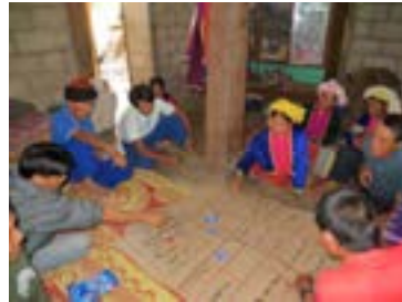
MEAS SFRC Case Study 7 Farms in SE Asia