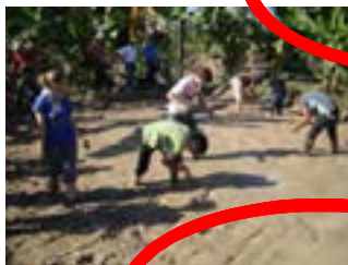
Sustainable Food Production Workshop - May 12-14, Aloha House, Palawan, Philippines