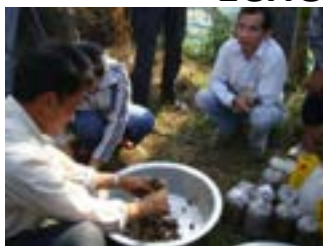
Indonesia Sustainable Agriculture Workshop - March 3-5, Medan, Indonesia