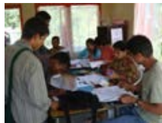
NEICORD - India