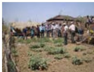
Field trip – 2012 East India Workshop