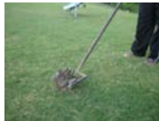
Unsuccessful local design