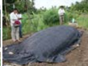
PE/trench biogas digesters