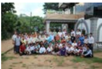
Group Picture- MBC Yangon Workshop 2012