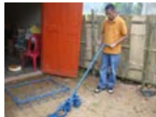
Cono-Weeder at NEICORD Office in India

Assistance in accessing needed technical resources