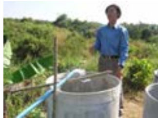
MBC Christian Social Service Development Department Myanmar