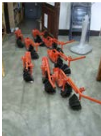
Fleet of new Cono-Weeders ready for distribution in Thailand and Laos