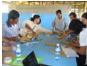
Cambodia - 2012