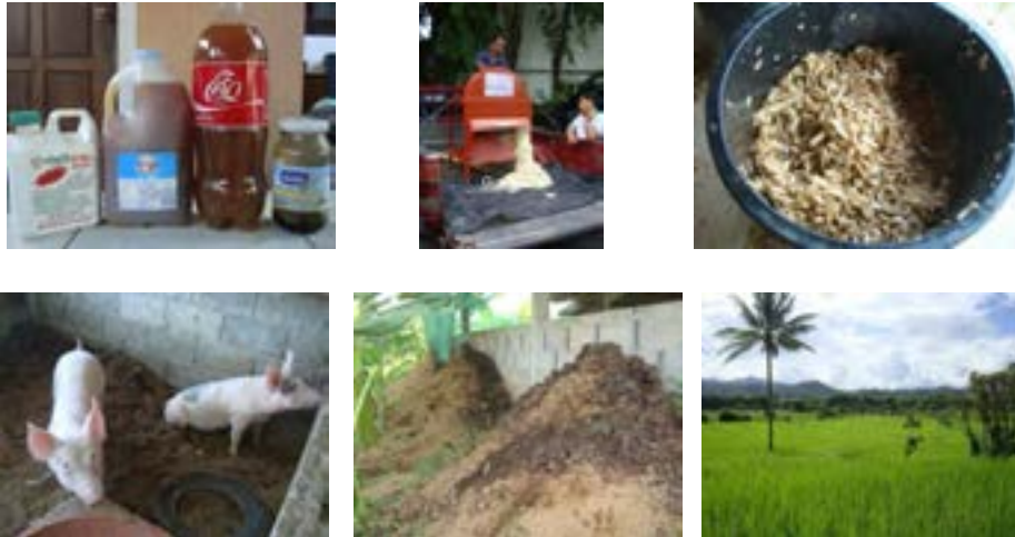
Asian Natural Farming – Putting microbes to work