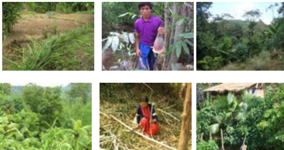
Agroforestry – Biodiversity equals year-round productivity