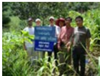
Wholistic Development Organization - Cambodia