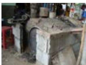
High quality charcoal kiln