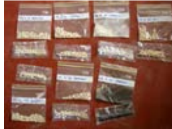
Insect Control in Stored Seeds