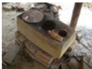
Rocket stoves use 2/3 less fuel