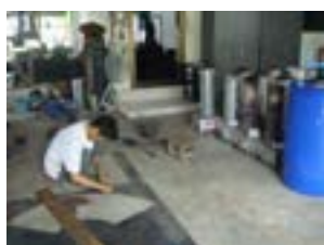
Gasifier stoves use rice husks as fuel