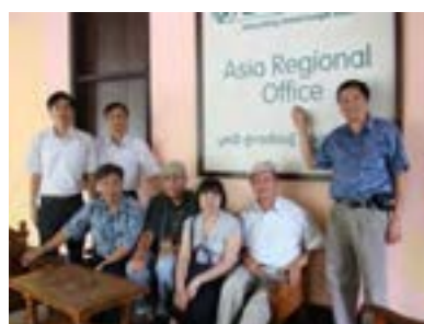
Representatives of Vietnam's Thai Nguyen University