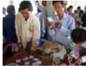
Southeast Cambodia - 2011