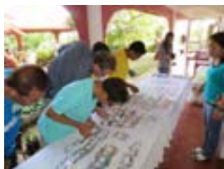
Seed Swap – 2013 Philippines Tropical Ag Workshop