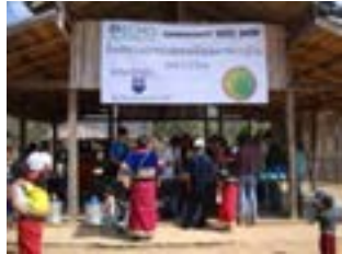
Northern Thailand - 2011