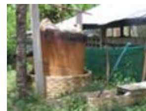
Biogas system fueled by livestock wastes