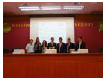
MOU signing between ECHO Asia Regional Office and Mae Jo University