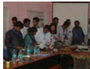
East India - 2012