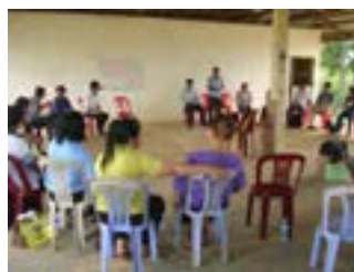
Networking session – 2012 Cambodia Workshop

National and regional agriculture and community development meetings