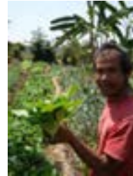
Pun Pun Farm - Thailand